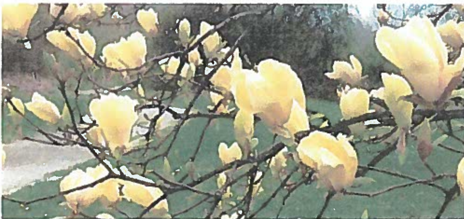
PHOTO: Magnolia 'Yellow Lantern', near the Herb Garden, recovered from fungal disease.

Continuing towards the Lilac Garden, turn left towards the curved benches where some fragrant hyacinths are in full bloom. Many plants are poking up behind the stone wall near the lilacs. The lilacs will start blooming later in May and the other plants in this newly completed Fragrance Garden will bloom during the summer and fall. Return to the trail and head towards the Butterfly Garden where the early spring flowers are evident. This garden is familiar to many of us for its