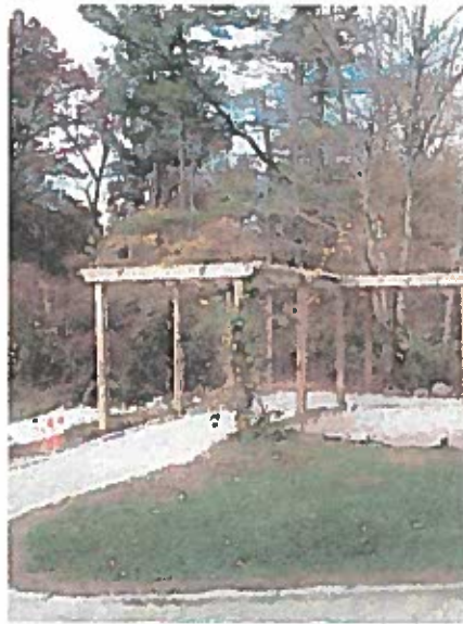
PHOTO: Grape Arbor improvements.