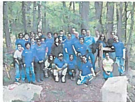
PHOTO right: Thirty volunteers from Vertex Pharmaceuticals tore down the failing Wildflower Boardwalk, before reconstruction, funded by CPA.

After a long, snowy winter, the Arboretum looks better than ever this May! Starting right at the Taylor Road entry, one can immediately enjoy the newly planted areas sporting columbine and other spring flowering plants. Daffodils bloom along the new sidewalk and adorn the day lily garden. When you walk towards the Rhododendron Garden, you can notice the newly planted sunny meadow garden planted just last fall that's surrounded by snow fencing to keep intruders out while the plants settle in. In the Rhododendron Garden you can see shrubs and can notice the bulbs and perennials planted among the shrubs last fall. The nearby meadow is much more open after town staff mowed it and after volunteers removed walnut saplings. Continuing towards the boardwalk over Mary's Brook, you see a much wider trail, the result of hard work this spring to remove invasive honeysuckle shrubs. Notice the wildflowers just planted along the cleared area. As you clear the boardwalk and walk uphill towards the Wildflower Garden, you can see an ever-changing variety of plants in bloom, from the early bloodroot with its white flowers to the Virginia bluebells, the yellow wood poppies, and the purple trilliums. May apples and foam flowers will be in bloom soon.