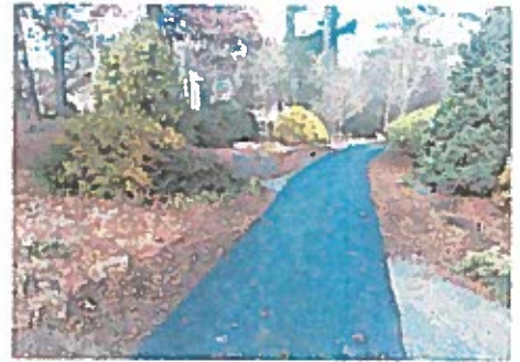
PHOTO: The new Taylor Road sidewalk

Last year, my letter provided a tour of the Arboretum at its spring peak after a snowy winter. This year, while a similar narrative would apply, so much is soon to happen at the Arboretum that I want to describe that instead. All these projects represent long hours by the Natural Resources Department to update and improve the Arboretum's infrastructure, with help from other Town departments, and support by the Friends of the Acton Arboretum. As the numbers of visitors increase, it's especially important to have a safe and accessible parking lot, kiosk, boardwalks, and trails.