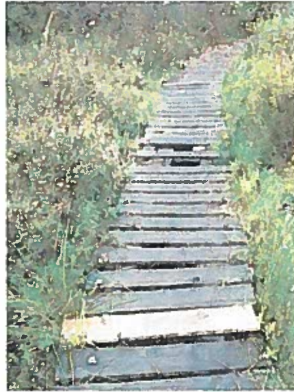
PHOTO: Former Bog Boardwalk