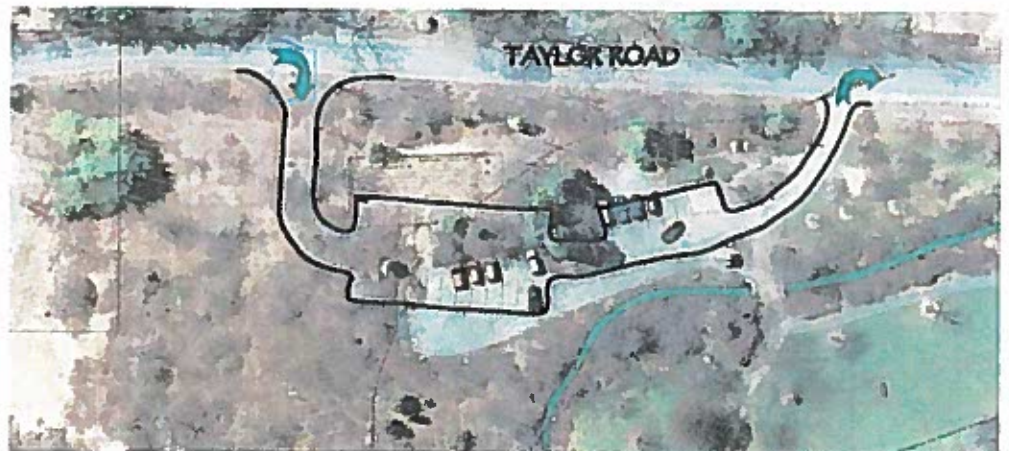
PHOTO: New Taylor Road Parking Lot Plan. Construction is expected to begin late summer.

Volunteer gardeners work at the Arboretum at least every Tuesday afternoon and Thursday morning. Their work has brought us beautiful gardens. Last year,