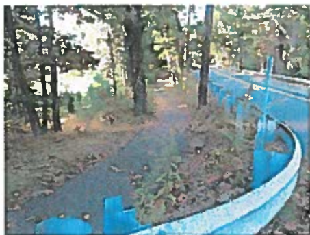
PHOTO: Central Street Sidewalk

The Arboretum Bog Boardwalk is in the process of being rebuilt with Community Preservation Act funds, generous donations from the public, and a donation from the Friends of